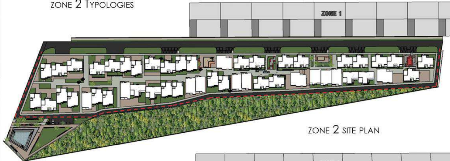
ZONE 2 SITE PLAN