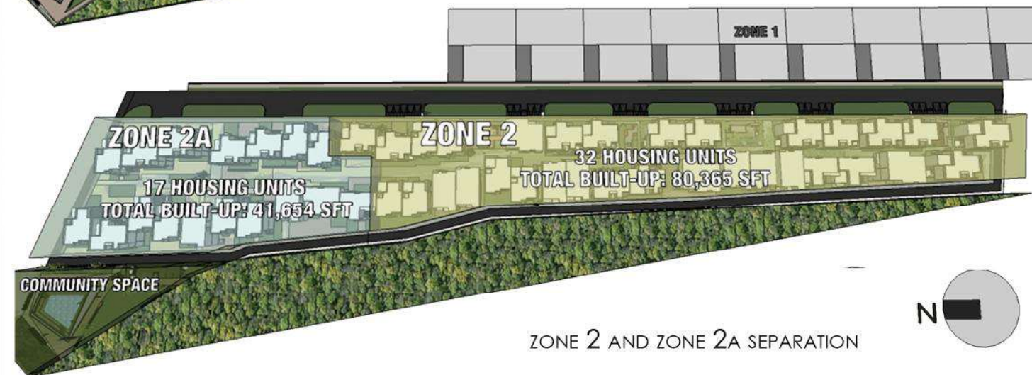
ZONE 2 AND ZONE 2A SEPARATION