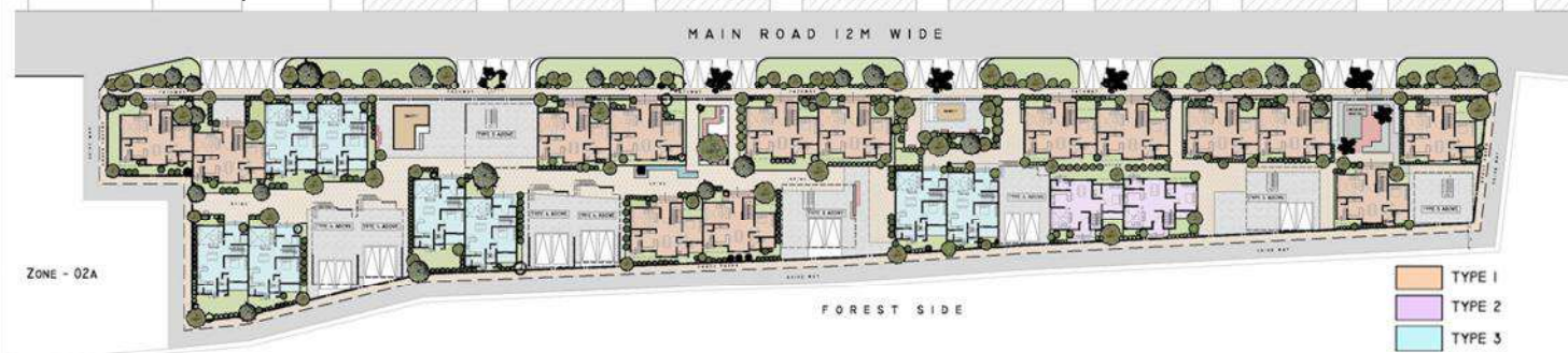
ZONE 2 TYPOLOGIES