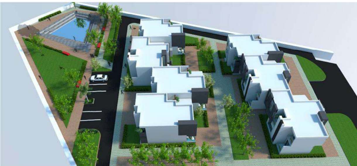
COMMUNAL SPACES WITHIN ZONE 2A