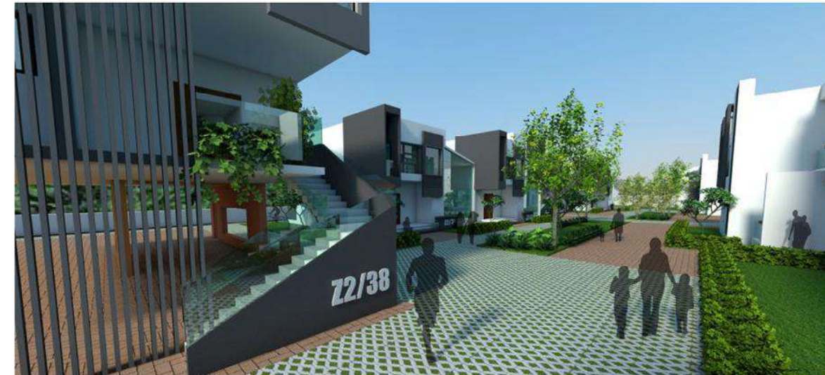
VIEW OF TYPICAL ZONE 2 VILLAS

The competition entry included 6 zones to be designed out of which I was in charge of designing ZONE 2. The building experiments with edges and angles. This zone had opportunities of designing community group housing villas with more emphasis on the public zones which were spill overs of the private villas.